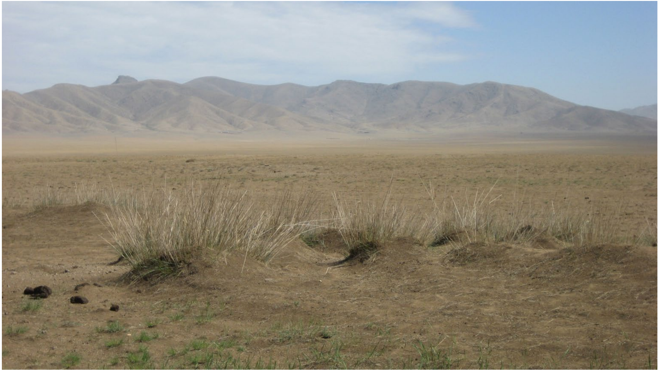
Mongolian desert grasslands